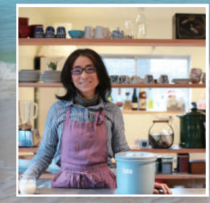
Hamilton-san Tabel Table, miso specialist