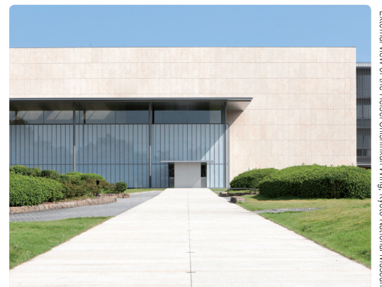
External view of the Heisei Christainkan Wing, Kyoto National Museum